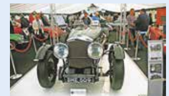
Historics at Brooklands now offers credit on cars up for auction.

While gratification may well be relatively instant for those who buy classics on the tick, they will, of course, have paid considerably more for their toys by end of term. If the finance trend does catch on, the prices of all £10k+ classics will almost certainly rise in sympathy. Only a return to a softer market will frighten away the bulls.