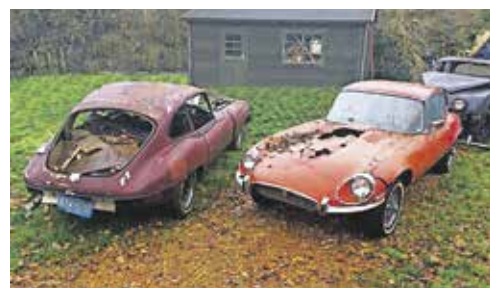
Fancy a brace of E-type projects? £7k-9k each at ACA.