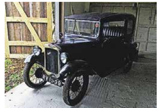
Austin 7 Box saloon has just joined the HVA line-up.